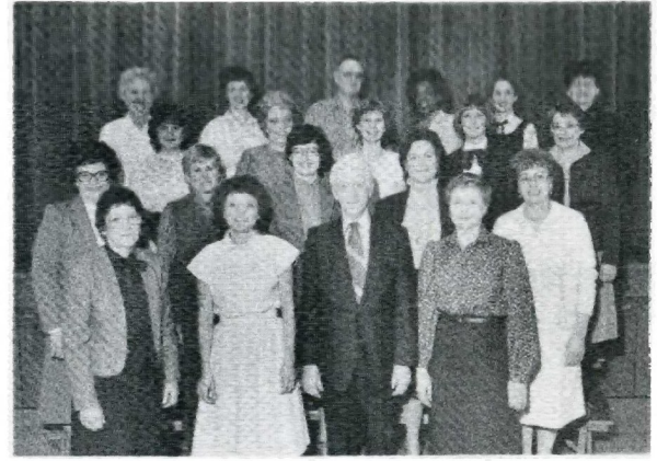
Staff of 1984-85

1:30 p.m. - Grade Six 1:50 p.m. - Springville Mothersingers 2:10 p.m. - Grade Two 2:30 p.m. - Springville Mothersingers 2:50 p.m. - Grade Five 3:10 p.m. - Grade One 3:30 p.m. - Grade Four 4:00 p.m. - Grade Three