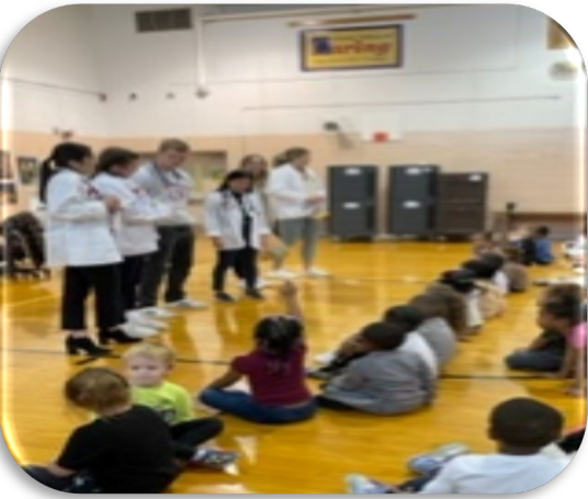
UNMC students providing health and nutrition lesson to Wakonda students.

OPSHS/EHS partners with Nebraska Methodist College and the Douglas County Health Department Lead Prevention Program to offer lead and hemoglobin screening at school. A nurse instructor and nursing students go to Head Start schools and provide hundreds of screenings to students at schools located in target zip codes within the Omaha Lead Superfund sites. This year we were able to include screenings at all sites that serve Head Start students. For children with elevated lead levels, families receive a voucher for follow up venous blood draws, and appropriate medical treatment as needed.