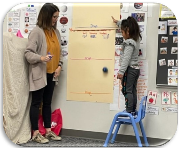
Spring Lake students completing a bouncing investigation during the Creative Curriculum Ball Study.

Assessment data is gathered for individual children daily using TS Gold. Additional child data is gathered using the Brigance screening, including the Social/Emotional screening. Each classroom provides daily large and small group instruction. Teachers use data to inform the structure of the groups. This is documented in the TS Gold Weekly Planning Form. When a child is not making progress or is far from the widely held expectations for his/her age, more individualized instruction takes place. This may include one-on-one instruction/interactions, intentional activities, additional resources gathered from and provided to the families, and may include a referral as necessary.