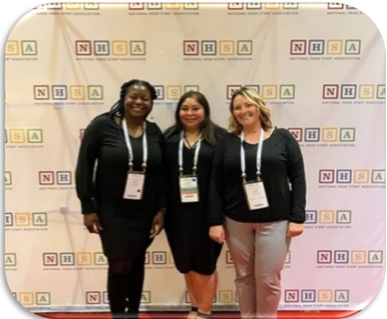
In December, staff attended the 2022 NHA Parent and Family Engagement Conference in Dallas, TX.