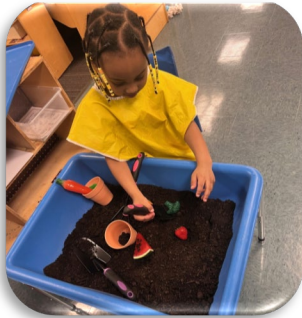
Students at Miller Park having fun exploring soil during the Garden Study.

In the 2022-2023 program year, we were federally funded to serve 899 families (including our Delegate, Educare). Three hundred and six single parent families and two hundred and sixty-four two-parent families benefited from the Head Start program during the year. Monthly average enrollment was maintained at approximately 90%.