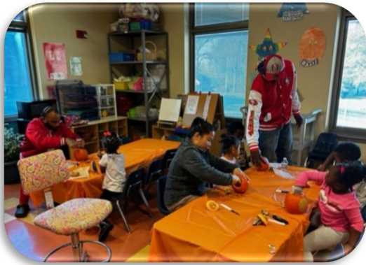
Families exploring pumpkins while attending Fatherhood Event at Mount View Elementary.

In the 2018-2019 school year, our program adopted the Conscious Discipline Parent Education program. Conscious Discipline is an evidence-based learning tool that focuses on social-emotional development and systematic change. We currently use the Conscious Discipline plan as a piece of our ongoing parent committee meetings at each school site. Over 1,000 total participants attended events including parent meetings, family engagement activities, and family nights during the 2022-2023 school year.