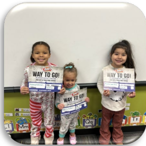
Students at Gateway received an OPS Attendance award for having perfect attendance.