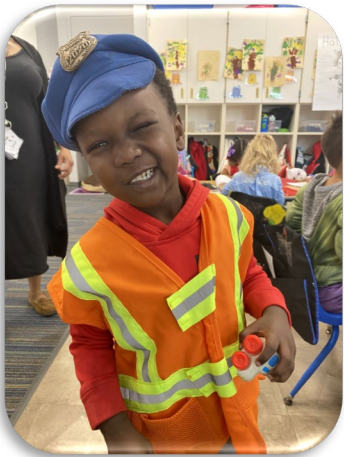
Student enjoying dramatic play during centers.

The continuation of this initiative ensures our preschool programs are high quality evidence-based systems that will positively impact children’s school readiness, social, emotional and physical health. In addition, it serves to meet families’ needs for providing seamless, full-day services.