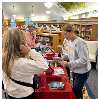
Photos left to right: Grins from the volunteer grounds crew; Donuts for the win; A bustling Book Fair transformed the library.