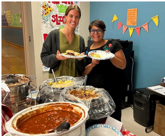
The PTO served teachers and staff hot meals during conferences.

Amidst a flurry of activities that we have had, as we enter into November we will truly get into spirit of giving and giving thanks. Teacher Wish List updates are underway. Be on the lookout for the link to the latest teacher wish lists in next month's newsletter (along with a flyer in a future Wednesday folder)!