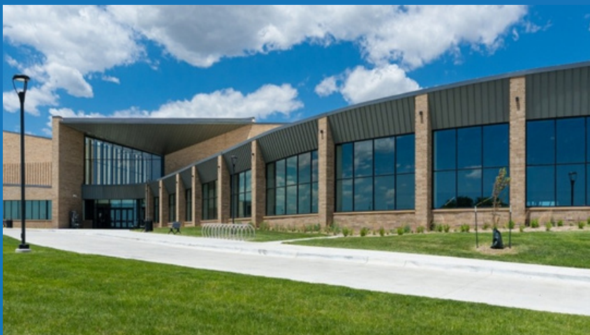
Westview High School