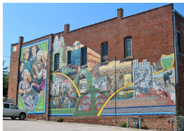
4. South Omaha Mural Project 4808 S 26th St.

This organization focuses on the health and well-being of Mayan immigrants in Omaha. It provides a place where Mayan immigrants can continue learning and performing their cultural practices.