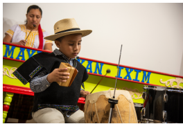
3. Comunidad Maya Pixan Ixim 4913 S 25th St

El Museo Latino exhibits a large range of Central and South American cultures. Guatemalan cultures and traditions will often end up displayed and taught to the public.