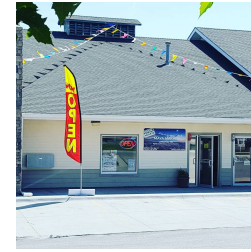
10. Maya Market 2910 K St C

Chiltepes is a restaurant serving authentic Guatemalan foods; such as burritos, empanadas, pupusas, tamales of rice and corn tortillas and more. They cater to Guatemalans searching for a taste of home, with their menu in Spanish.