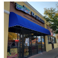
12. El Quetzal Market 1941 Vinton St

A market with products from Mexico and Central America.