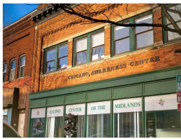
1. Latino Center of the Midlands 4821 S 24th St

The Latino Center of the Midlands was organized in 1917 to address concerns about the education of Chicano youth. They work to develop youth and young adults by promoting comprehensive engagement, higher education, employment and careers to the Chicano community.