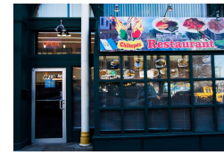
9. Chiltepes 2308 N St

Saint Francis of Assisi hosts a large number of Guatemalan parishioners, and performs Mass in Spanish at 11:30 on Sundays.