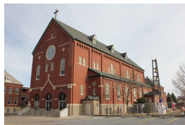
7. St. Joseph 1723 S 17th St

St Frances Cabrini, a Catholic church in the Archdiocese of Omaha, that co-sponsors (in partnership with Diocese of Huehuetenango, Guatemala) a ministry called Ixim: Spirit of Solidarity that is dedicated in aiding Guatemalan communities thriving in Huehuetenango. Their main goal is to support families in Guatemala by providing health care, clean water and a proper education.