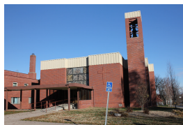
8. St. Francis of Assisi 4513 S 32nd St

Saint Joseph serves the Spanish speaking community with services in Spanish. It is an important place for the Catholic refugees who come to Omaha.