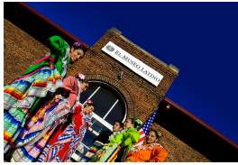
2. El Museo Latino 4701 S 25th St

The Latino Center of the Midlands was organized in 1917 to address concerns about the education of Chicano youth. They work to develop youth and young adults by promoting comprehensive engagement, higher education, employment and careers to the Chicano community.