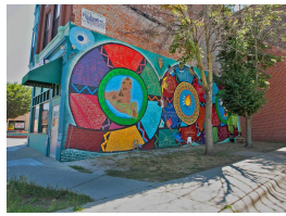
5. Mayan Community Mural 2401 N St

This organization creates murals that represent different cultures in the Omaha community.