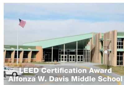
LEED Certification Award Alfonsa W. Davis Middle School