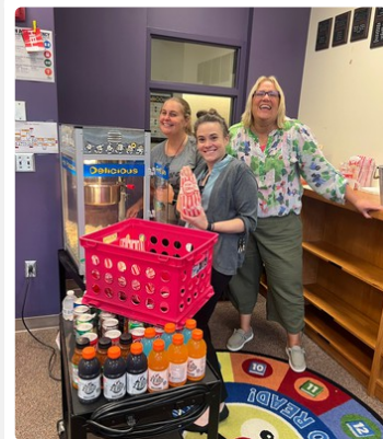
Staff treat from the leadership Team