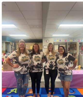
Pre-K Team Ready to Go