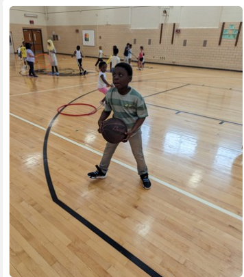
PE Class Fun