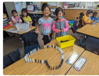
Fun in STEAM class