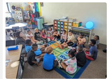
Getting to Know our Classmates