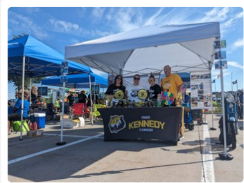
Excited to show off Kennedy Greatness!