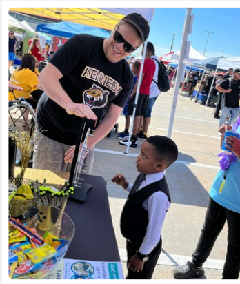
Spinning the Wheel for Prizes